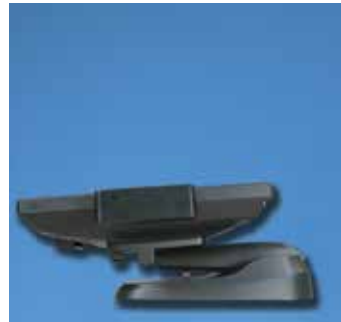
Double Articulating Terminal Folds Flat