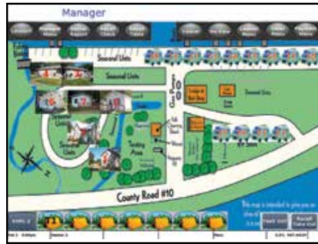
Customized graphical table maps.