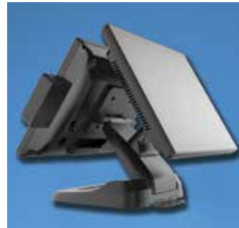
Optional Integrated 15" Rear LCD Customer Display (Reflection POS for Windows)