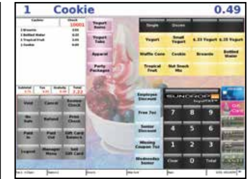
Menu items, condiments, flavors, instructions and options can be placed upon one key. When an item is registered, a specific key displays the options available for the item. You can control how many choices can be made as well as what options display next.