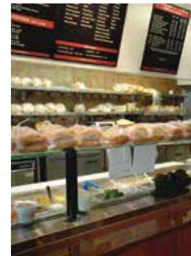
Cafeterias / Table Service / Quick Service