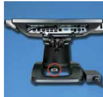
Cable Management Keeps Cords Hidden and Organized (RJ48-DB9M Adaptor Included)