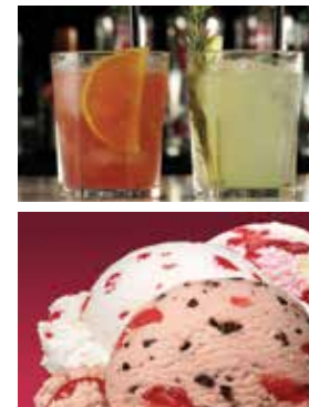
Bars / Ice Cream Parlors / Coffee Shops