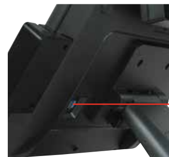
Two USB Ports Located on the Back of the Unit